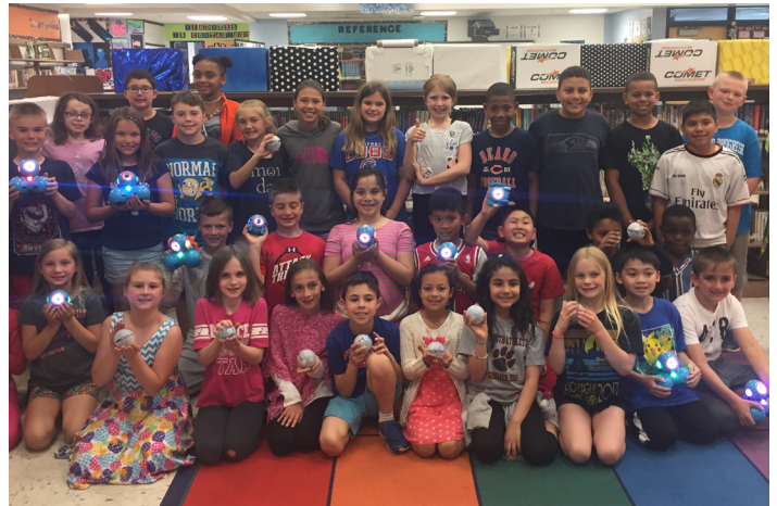
Students learn how to program Dash & Dot and Sphero SPRK+ robots in their coding club.

The visibility and brand recognition your company receives will demonstrate your commitment to education and the success of the next generation.