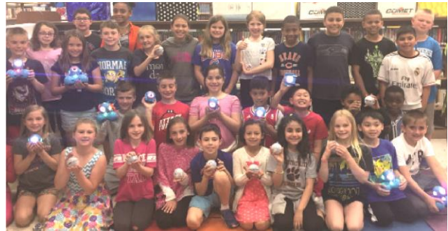
Students learn how to program Dash & Dot and Sphero SPRK+ robots in their coding club.

The visibility and brand recognition your company receives will demonstrate your commitment to education and the success of the next generation.